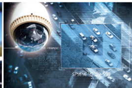
ITS (Intelligent Transportation System)