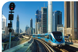
Rolling Stock System